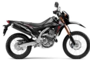
CRF 250 L + $0.00