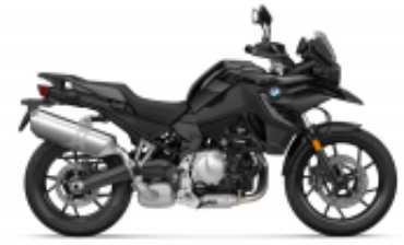
F 750 GS + $0.00