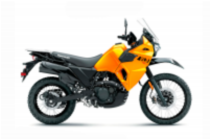
KLR 650 + $176.84