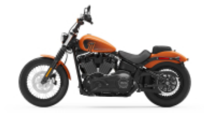
Street Bob + $0.00