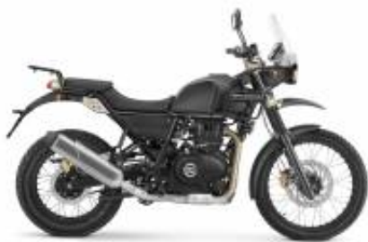
Himalayan 411 + $0.00