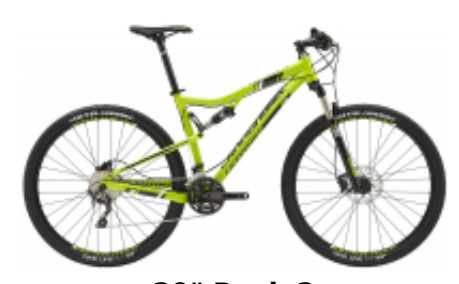
29" Rush 2 + $37.76