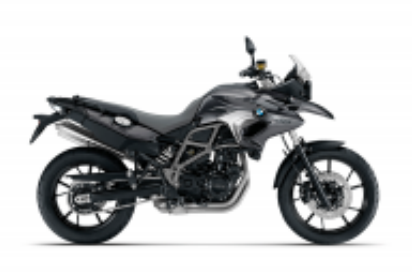
F 700 GS + $0.00