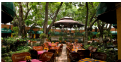
4 - Tequila - Sayulita - Tequila - Sayulita