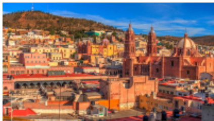
1 - Mexico City - Valle de Bravo - CDMX - Valle de Bravo (van)