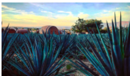
3 - Morelia - Tequila - Morelia - Tequila