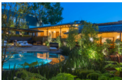
7 - Tlaquepaque - Zacatecas - Tlaquepaque - Zacatecas