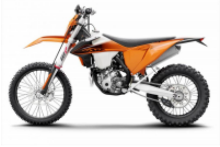
TPI/Six Days 300 + $0.00