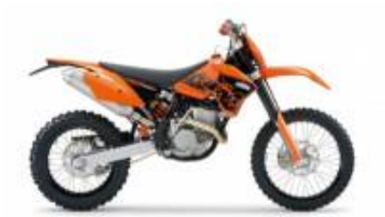
EXC 250 + $0.00