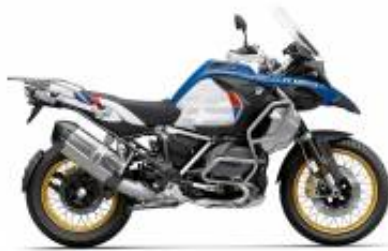
R 1250 GS Adv LC + $282.38