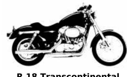
R 18 Transcontinental + $685.52