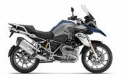
R 1200 GS + $945.64