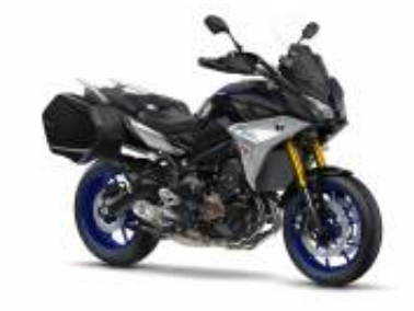
MT 09 847 + $502.01