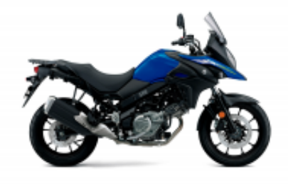
V-STROM 650 + $0.00