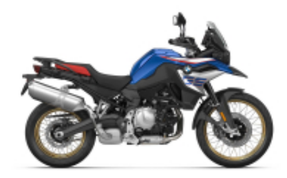
F 850 GS + $502.01