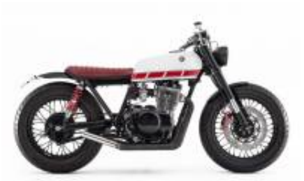
XS 400 + $0.00