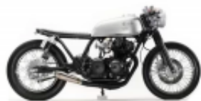
CB 250 Cafe Racer + $0.00