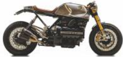
K 100 RS Caferacer + $0.00