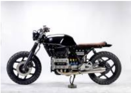
K75 Scrambler + $0.00