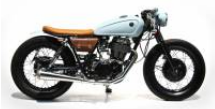
SR 250 Caferacer + $0.00