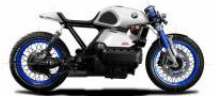
K75 Cafe Racer + $0.00