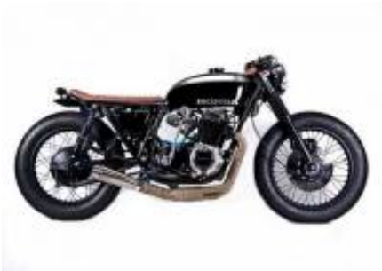
CB 500 Cafe Racer + $0.00