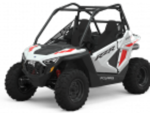
RZR 700 + $700.48