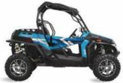
CF MOTO Z-FORCE EX 4x4 + $700.48