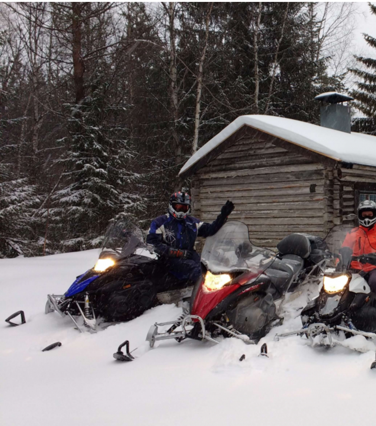
Snowmobile tour Sweden Polar circle