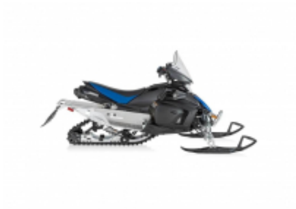
Viking 700 + $0.00