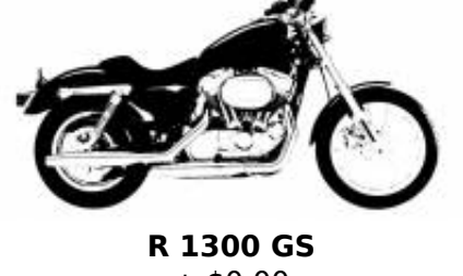
R 1300 GS + $0.00