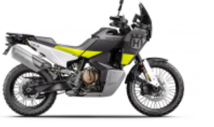
Norden 901 + $0.00