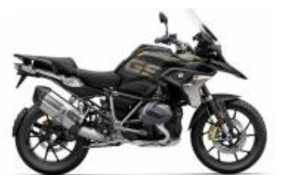
R 1250 GS LC + $0.00