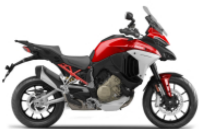
Multistrada V4 + $0.00