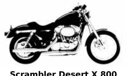
Scrambler Desert X 800 + $0.00