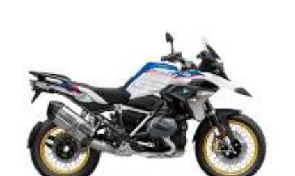
R 1250 GS HP Edition + $0.00