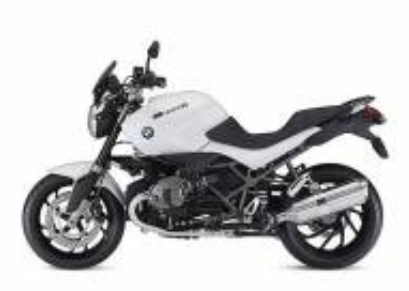
R 1200 R + $104.83