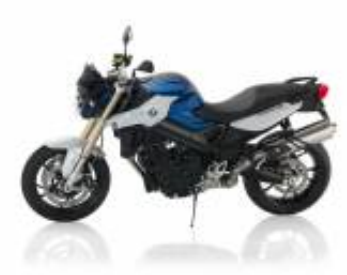
F 800 R + $104.83