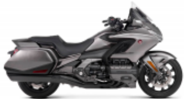
Goldwing DCT 2018 + $677.42