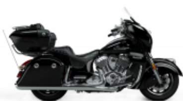
Roadmaster 1890 Grand Touring Class + $677.42