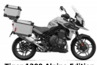
Tiger 1200 Alpine Edition + $2,337.06