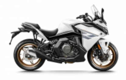
650GT + $1,223.52