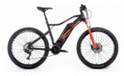
Graveler Sport Drive 10V 27,5 20.ETM.30 + $52.30