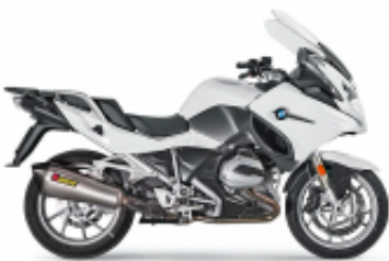
R 1200 RT + $465.29