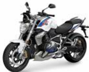
R 1250 R + $465.29