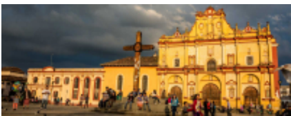
6 - Peña de Bernal - Guanajuato - Peña - San Miguel - Guanajuato