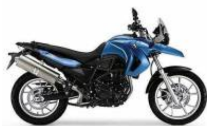
G 650 GS Twin + $700.00