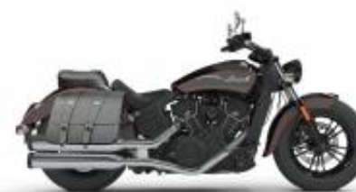
Scout Sixty + $700.00