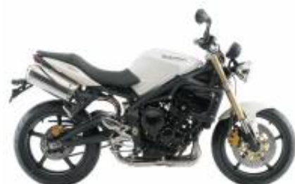
Street Triple 675 + $700.00