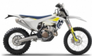
TE 350 + $0.00