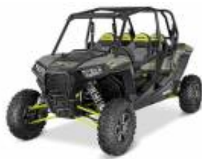
RZR XP® 4 1000 EPS + $231.34