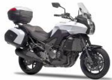
Versys 1000 Grand Tourer + $570.70