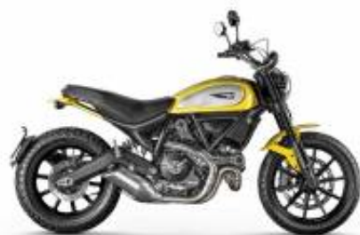
Scrambler Icon 800 + $290.45