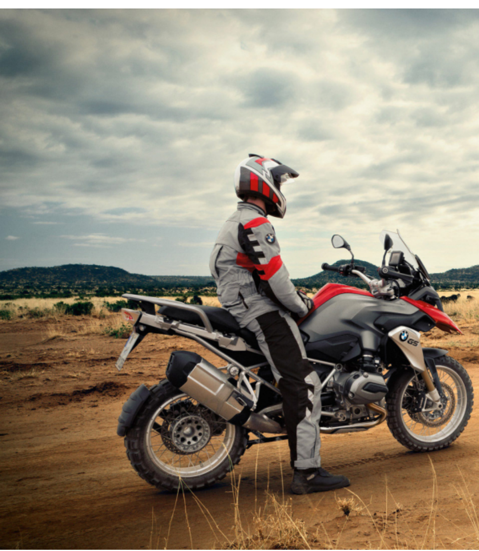
Motorcycle Enduro off Road Tour Balkan Express