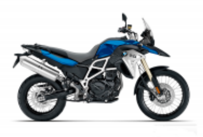
F 800 GS + $0.00