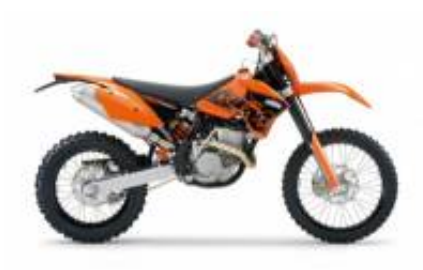
EXC 250 + $691.93