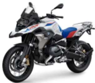
R 1250 GS Rally + $5,381.77