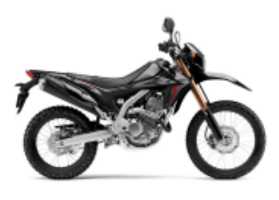
CRF 250 L + $755.96