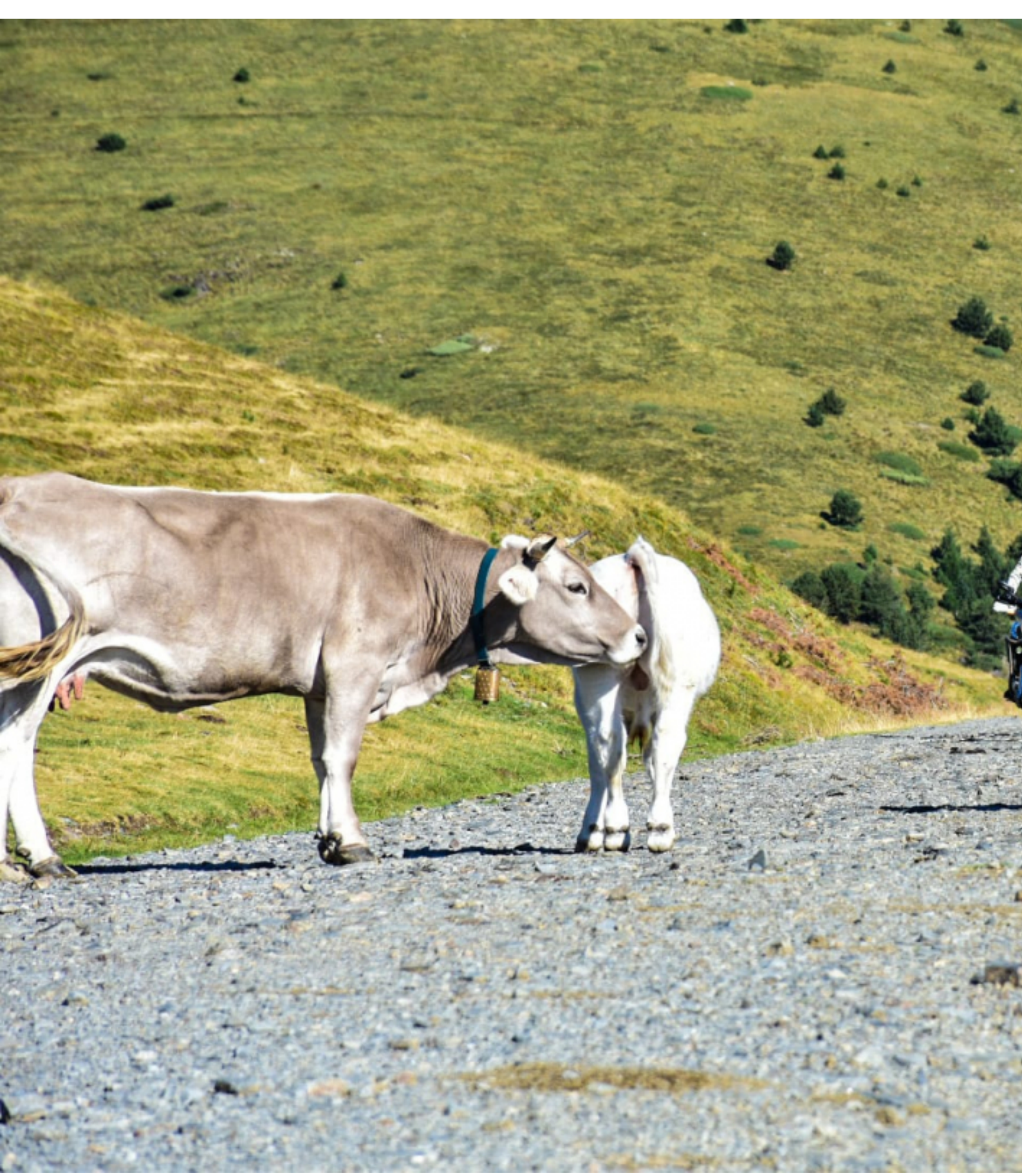
Motorcycle Enduro off Road or trail tour, Trans-Pyrenees 100% off road