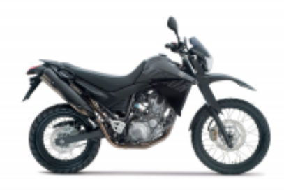
XT 660 R + $755.96