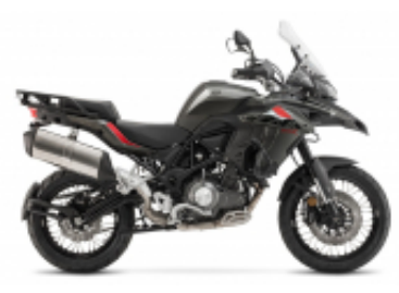
TRK 502 X + $0.00