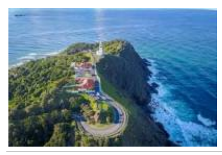
12 - Waterfall Way - Byron Bay -