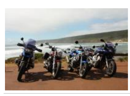
6 - Snowy Mountains - New South Wales -