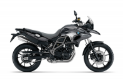
F 700 GS + $224.00