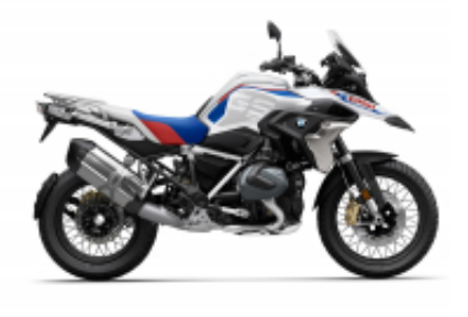
R 1250 GS + $1,002.10