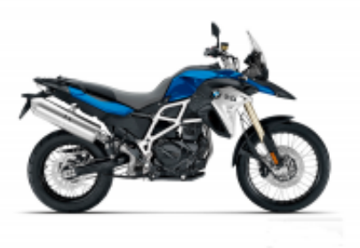
F 800 GS + $291.87