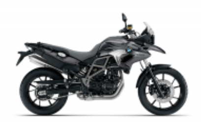
F 700 GS + $198.47