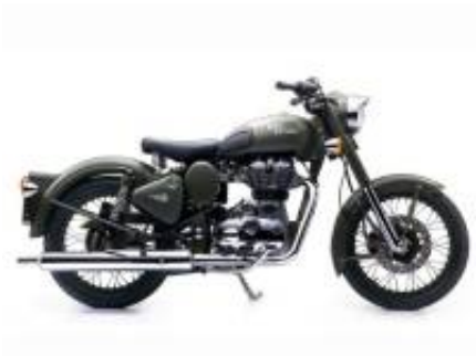
Military 500 + $0.00