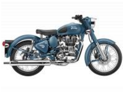
Squadron Blue 500 + $0.00