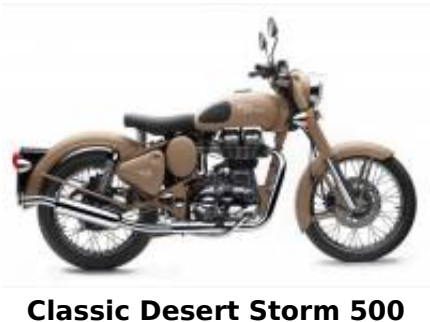
Classic Desert Storm 500 + $0.00