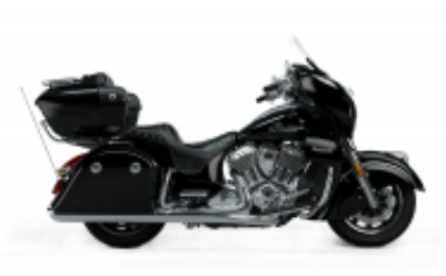
Roadmaster 1890 Grand Touring Class + $674.70