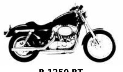
R 1250 RT + $334.45