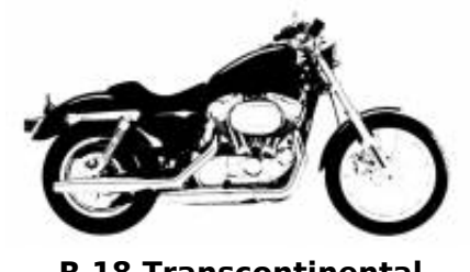
R 18 Transcontinental + $674.70