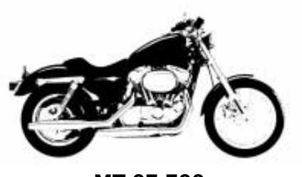
MT 07 700 + $0.00