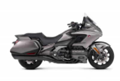
Goldwing DCT 2018 + $674.70