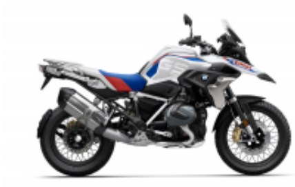
R 1250 GS + $334.45