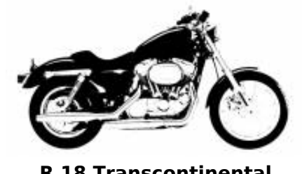
R 18 Transcontinental + $677.13