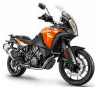
1290 Adventure S + $0.00