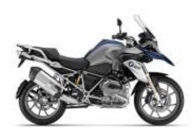
R 1200 GS + $279.15