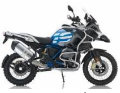
R 1200 GS Adv + $279.15