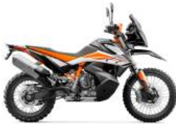
790 Adventure + $2,092.70