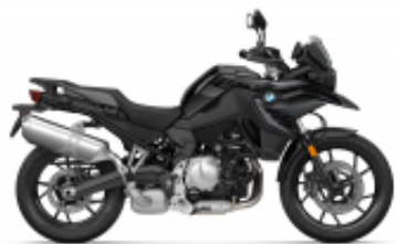
F 750 GS + $2,194.78