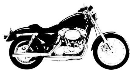
F 800 GS + $2,299.29