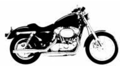
Rally 300 + $0.00