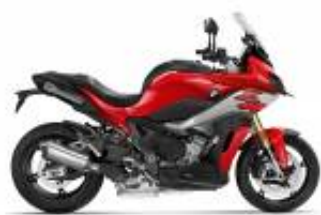
S 1000 XR + $175.36