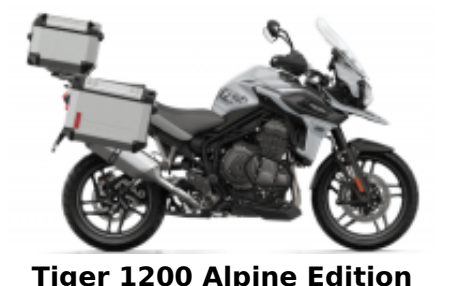
Tiger 1200 Alpine Edition + $2,283.64