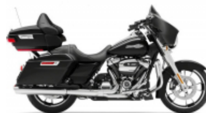
Street Glide Street Touring Class + $280.00