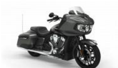
Challenger Street Touring Class + $420.00