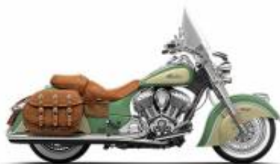
Chief Vintage + $420.00