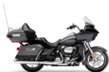
Road Glide Grand Touring Class + $420.00