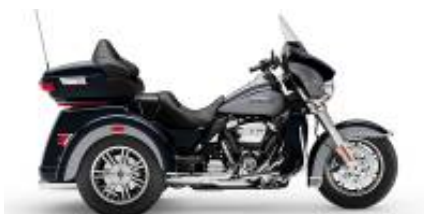
Trike Tri Glide (Gen) + $1,820.00