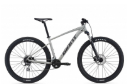
Talon 2 29 + $191.70