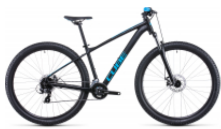
AIM 29er + $191.70