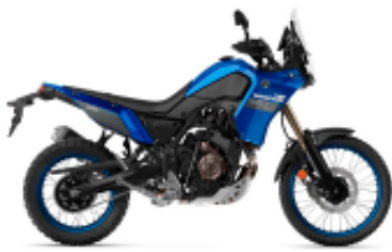
Tenere 700 + $0.00