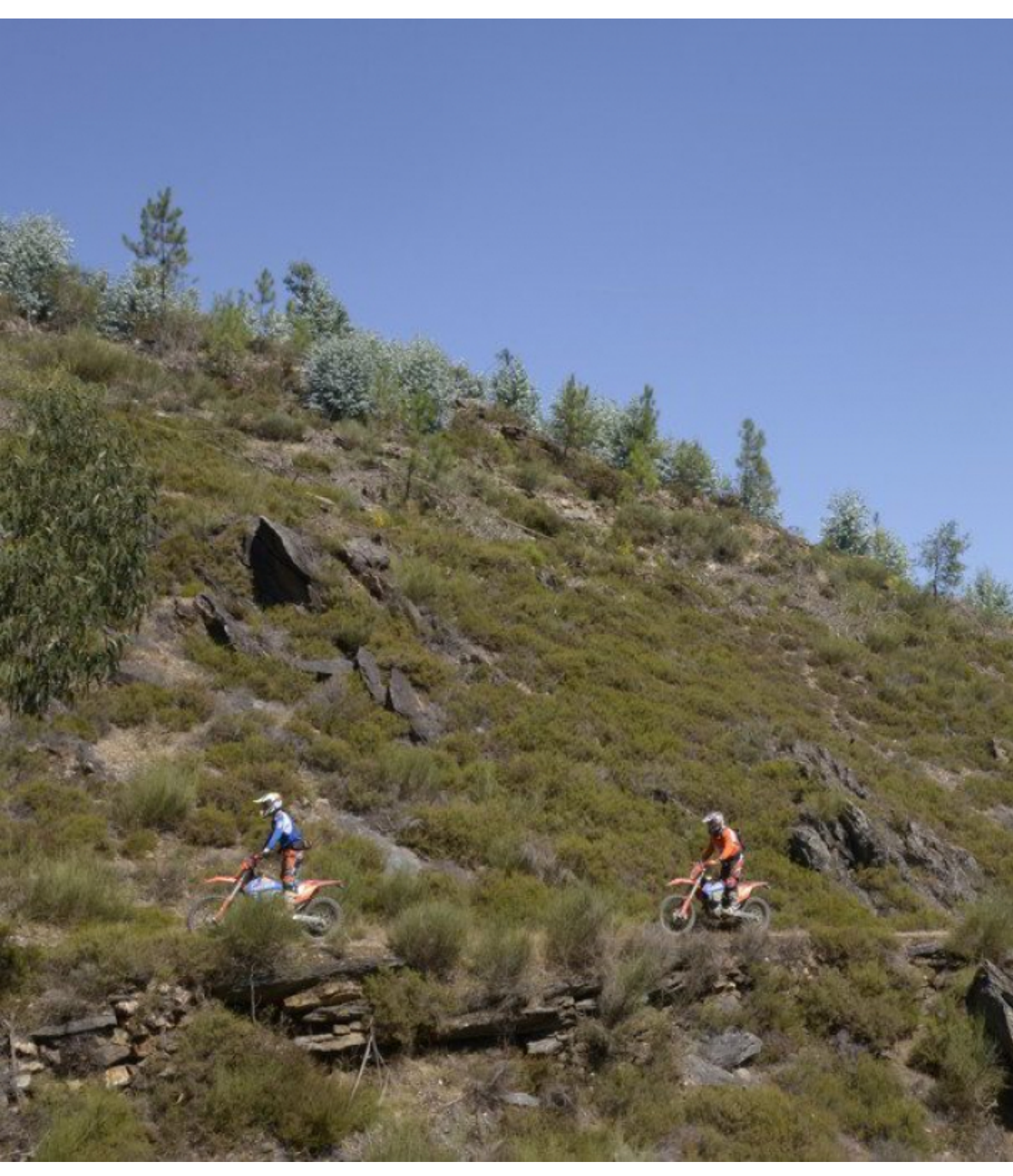
Motorcycle Enduro off Road Tour 2 Days in the Famous Tracks of Lagares, Porto