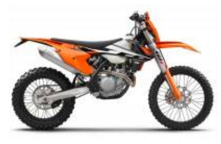
EXC 450 + $0.00