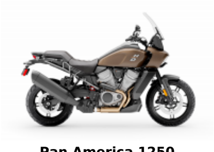
Pan America 1250 + $0.00