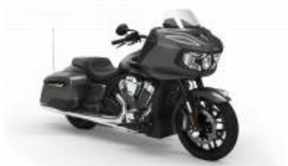
Challenger Street Touring Class + $390.00