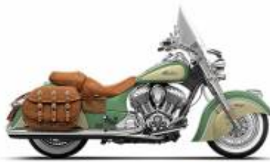
Chief Vintage + $390.00