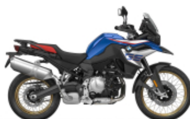
F 850 GS + $290.32