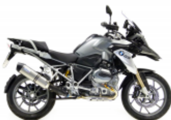
R 1200 GS LC + $527.70